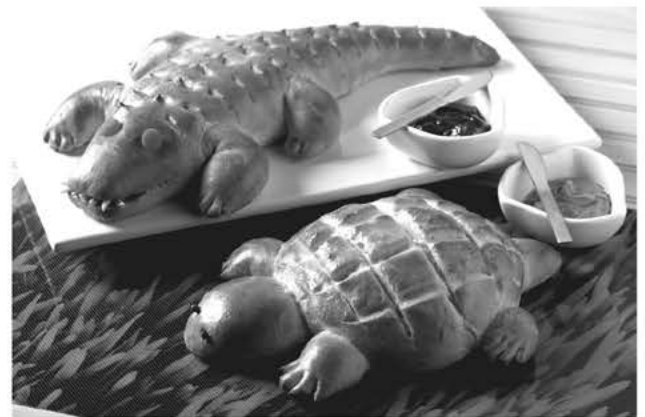
Alligators, Turtles (and more!) at breadworld.com